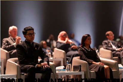
BA BANNALONA PAURIA 2024